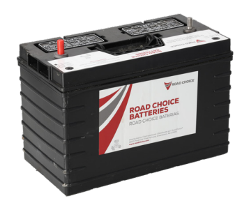
Skid Quantity - 54 Price valid for individual or pallet sales.