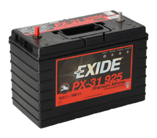
Skid Quantity - 54 Price valid for individual or pallet sales.