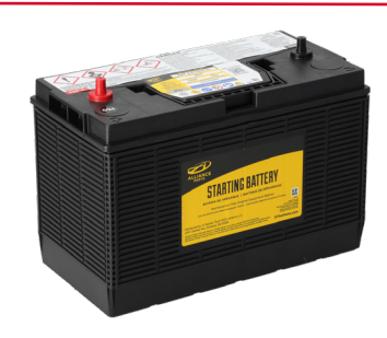
Skid Quantity - 36 Price valid for individual or pallet sales.