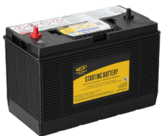
Alliance 925CCA Starting Battery