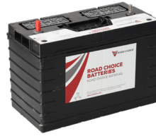
Road Choice GRP31 Battery