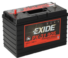
Exide PX-31 925 Battery