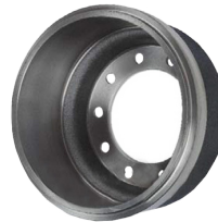
Alliance 16.5x7 Brake Drum